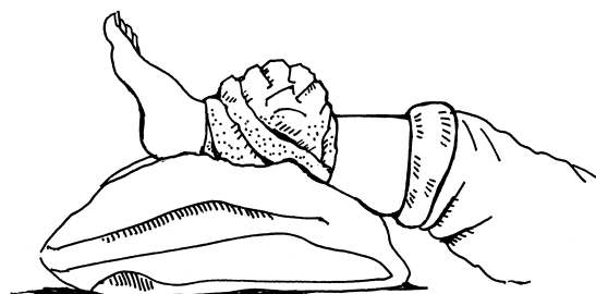
Apply ice for periods of 30 minutes.